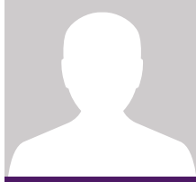
Young Members' Officer Vacant