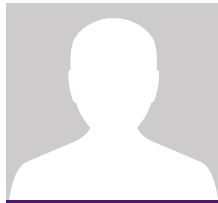
Equalities Officer (Women) Vacant

As part of the union's democratic process, nomination forms for any of the above positions are available from the Branch Office. We are keen to fill the Women's, Welfare and Young Members' Officer positions.