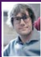
than 2016. This edition

A very happy new year! Unfortunately, we think 2017 is going to be even more challenging