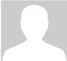
Welfare Officer Vacant