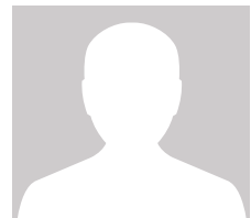
Membership Officer Vacant