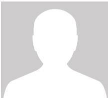
Communications Officer Vacant