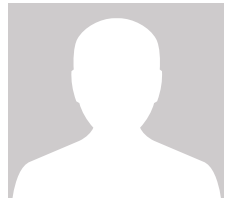
International Officer Vacant