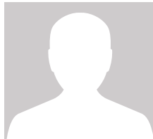
Education Co-ordinator Vacant