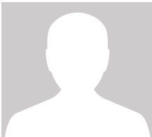
Membership Officer Vacant

As part of the union's democratic process, nomination forms for any of the positions here are available from the branch office. The annual election process for workplace representatives has also started. The nomination period for all positions ends at 12 noon on 26 January. If you are interested in taking on any role, please contact the branch secretary to find out more or request a nomination form. Branch committee meets six times per year (split between Chichester and Worthing). If you would like to get more involved with the branch, as a committee member or workplace rep, now is the time.