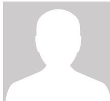
Labour Link Officer Vacant