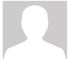
Lifelong Learning Co-ordinator Vacant