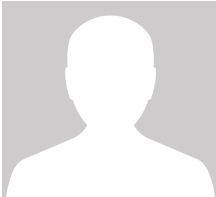
Equalities Officer (Women) Vacant