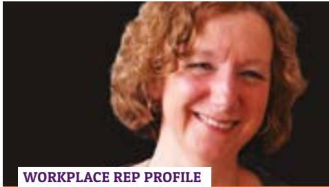
WORKPLACE REP PROFILE