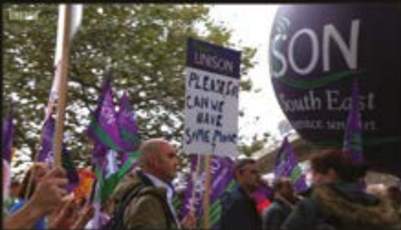
The Super-Rich and Us Episode 2